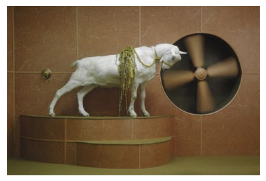
Hayden Fowler Goat Odyssey, 2006, digital video, 16:9 format, sound, colour, single channel, 15:10 loop, 61/70. Collection Rachel Verghis

Newell Harry Beginnings and Endings/Endings and Beginnings, 2008, neon (Helvetica, snow white), 10 x 330 cm, 2/5 + 2 AP.