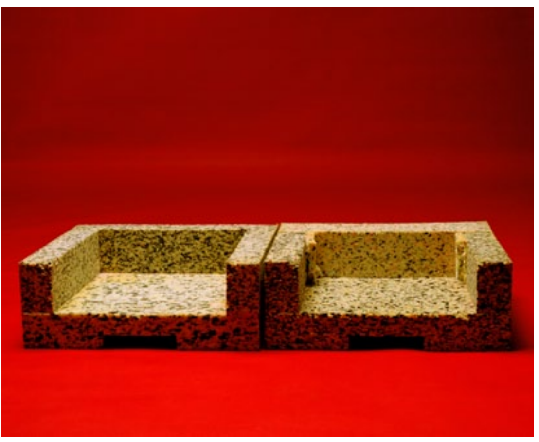
Vanila Netto Mini-Flex Super-Comfort, 2003-4, digital print on aluminium, 75 x 93 cm, 1/5. Collection Rachel Verghis

"I am interested in subverting the symbolic power of goods and utility by making photographs that suggest alternative systems, where modest, underrated sources are invested with unusual functionality and nobility. The human figure and selected discarded objects or materials are reconfigured to emphasise the intense, the unexpected, and the unusual in simple, improvised interventions."