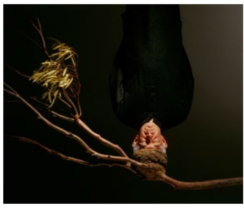
Hossein Valamanesh Nesting, 2005, digital print on watercolour paper, 113.5 x 135 cm, 4/5. Collection Rachel Verghis